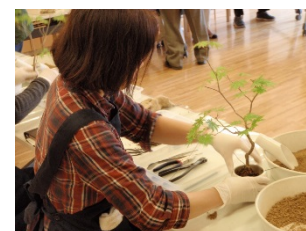
A bonsai workshop will also be conducted.