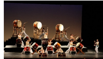
New Year's Taiko Drumming Fest