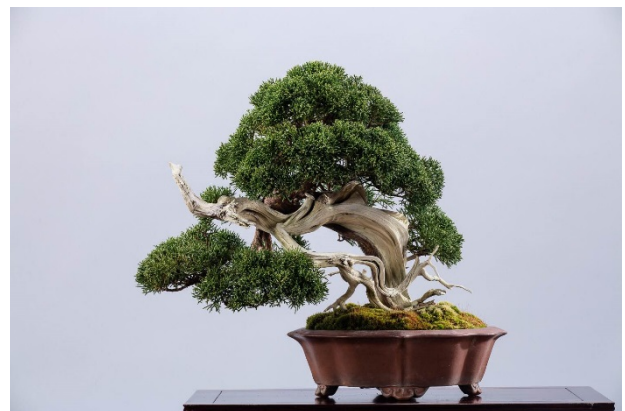
Internationally award-winning bonsai miniature trees supplied by Omiya Bonsai Museum and Omiya Bonsai Cooperative will be on display.