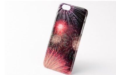
A smartphone cover with a traditional design.

With the help of the Recreation Association of Tokyo (RAT), this area will be a playground where visitors can learn and participate in traditional New Year’s recreational activities such as hanetsuki (similar to badminton), karuta cards, fukuwarai blindfolded face puzzle, and kendama ball-flicking toys.