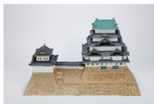
Replica of Nagoya Castle