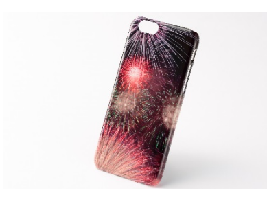
A smartphone cover with a traditional design.

With the help of the Recreation Association of Tokyo (RAT), this area will be a playground where visitors can learn and participate in traditional New Year's recreational activities such as hanetsuki (similar to badminton), karuta cards, fukuwarai blindfolded face puzzle, and kendama ball-flicking toys.