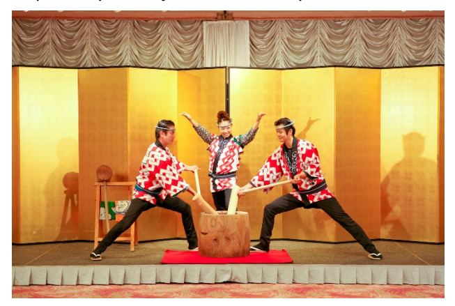
Iwai Mochitsuki : A celebratory mochi -making performance will be held with tasty samples.

We hope that you can join us at the Tokyo International Forum to greet in the new year of 2017.