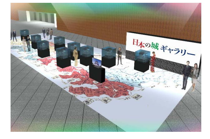
Thirteen precision-crafted replicas of Japanese castles will be on display including Edo and Nagoya Castles.